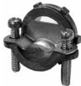
C-750 and C-1000