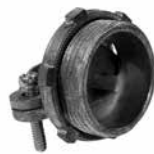
C-1250 thru C-2000