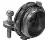
C-1001-R thru C-1501-R